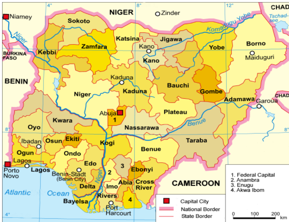
Map of Nigeria showing its 36 states and the Federal capital territory.