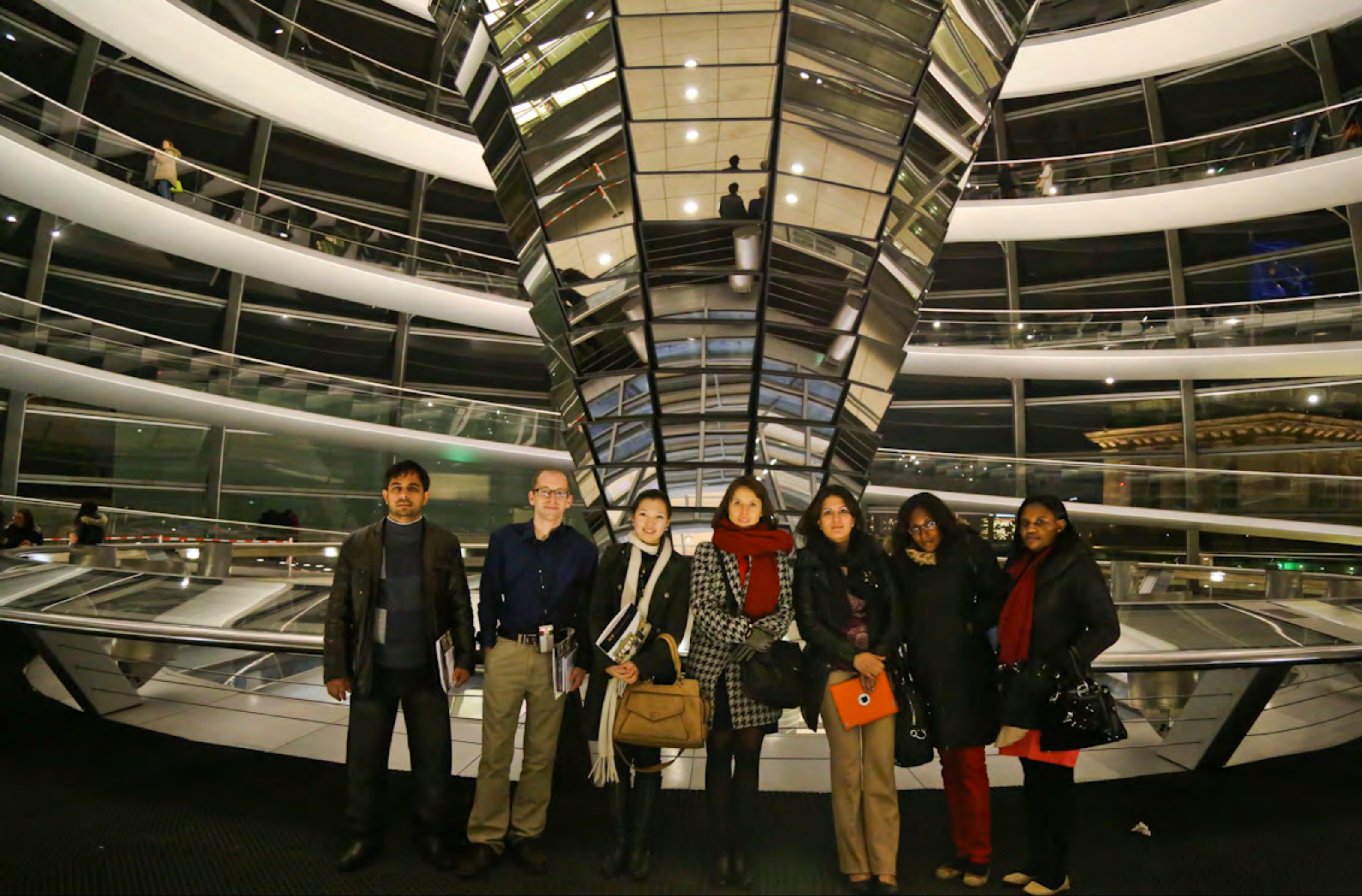
Participants of the Conference visiting the Reichstag (Berlin; February 12th - February 14th, 2014)