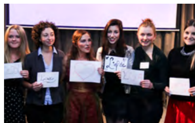
Participants of the conference in their own language

The conference concluded with the showing of a Rwandan film to mark the 20th anniversary of the Rwandan genocide followed by a panel discussion with the Ambassador of Rwanda to Germany and Eric Kabera, the film’s producer. The Rwandan Embassy then gave a reception in which delegates, officials and ICD representatives networked and discussed the past proceedings over wine and food, kindly provided by the Embassy.