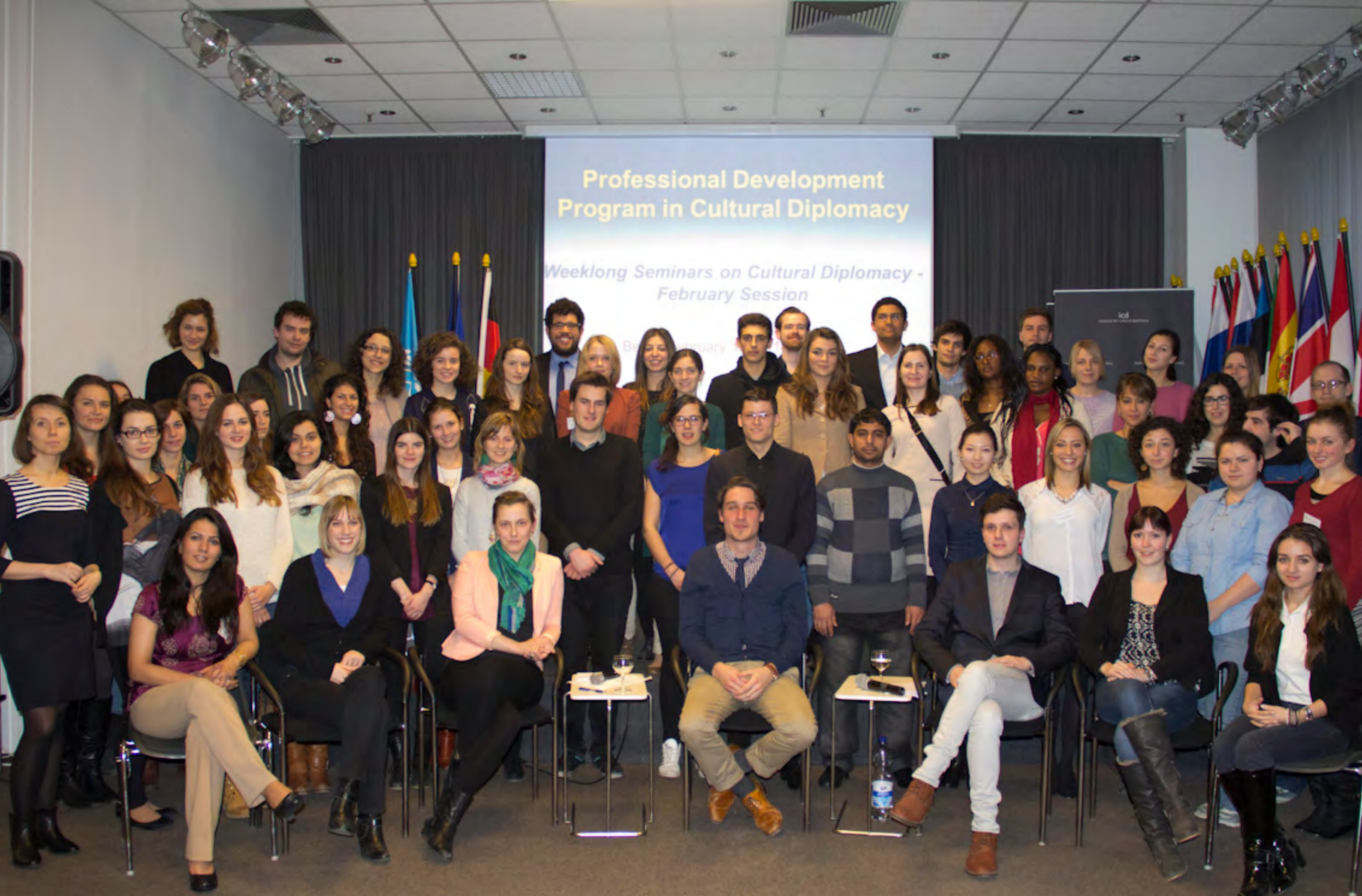
Participants of the Berlin Language of Arts & Culture Conference 2014 (Berlin; 12th - 14th February, 2014)