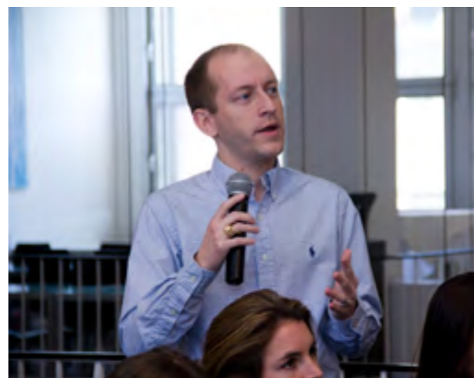
Participants during the social aspect of the conference