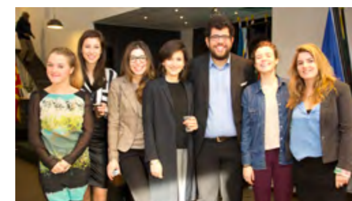
Participants of “The Berlin Language of Art and Music 2014”