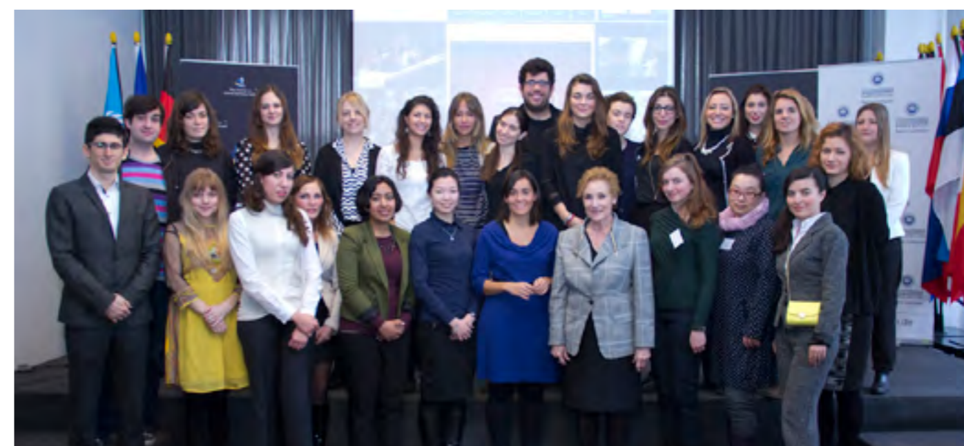
Participants of the Conference