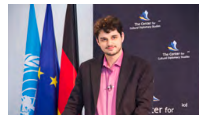
Serbian Actor Nikola Rakocevic