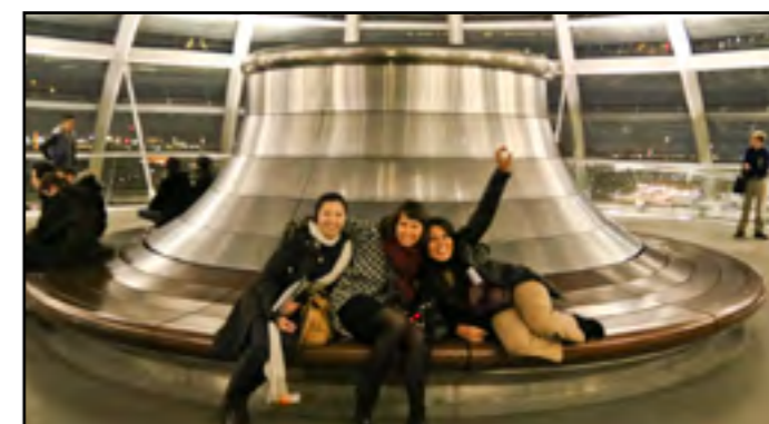
Visiting the Reichstag