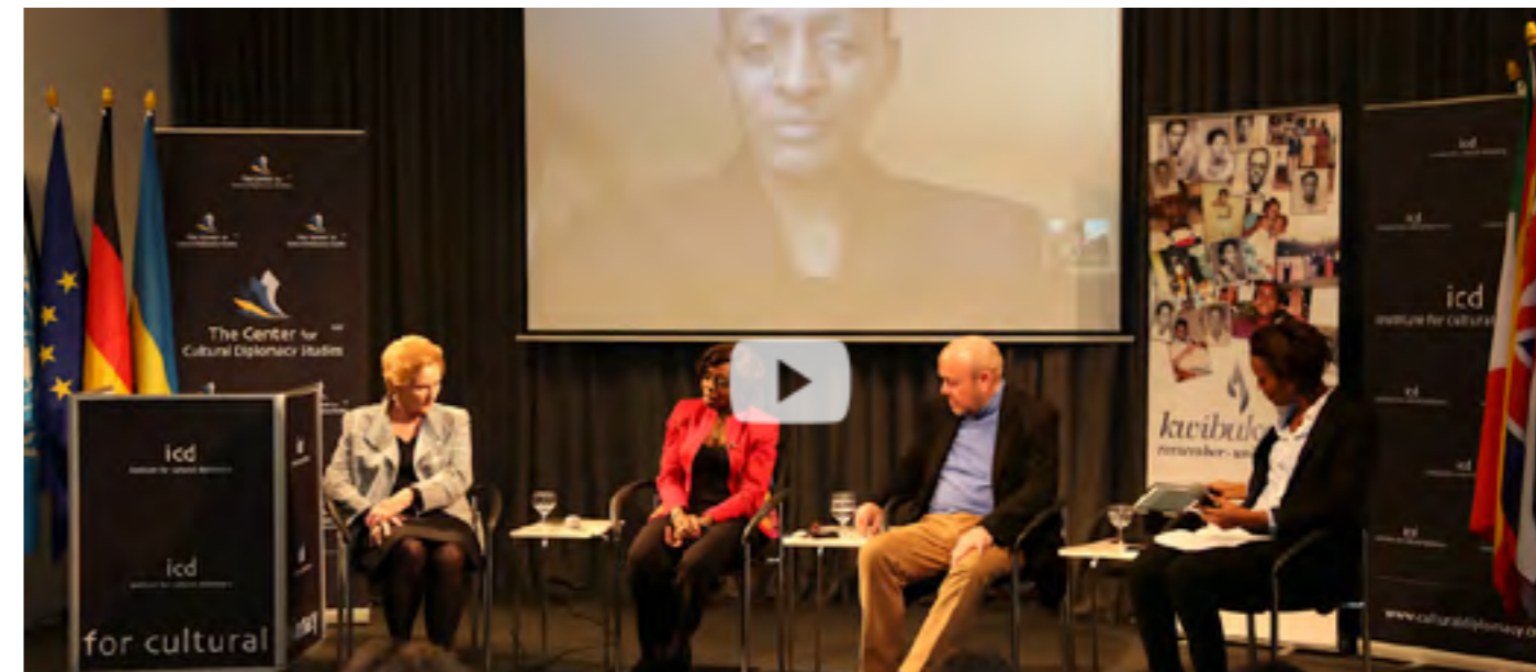
Commemoration of the 20th Anniversary of the Rwandan Genocide An Event host by the Embassy of Rwanda to Germany