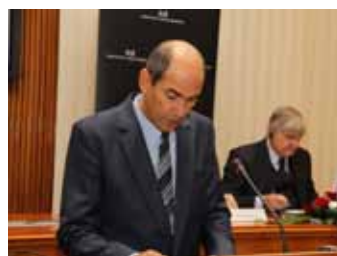
Prime Minister Janez Jansa Prime Minister of Slovenia