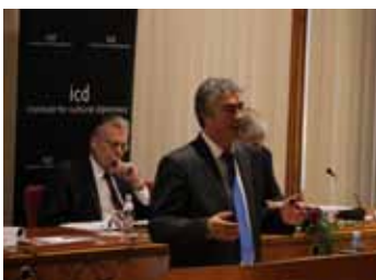
Dr. Milan Zver Member of the European Parliament

The Conference was an opportunity to analyze the role of National Governmental Bodies, Global Governance Institutions, NGOs and Civil Society Organizations to protect, prevent and punish crimes against humanities and genocide.