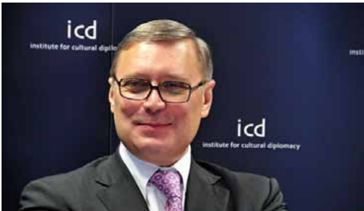
An interview with Michail Kasyanov, Former Prime Minister of Russia The Europe Meets Russia Conference