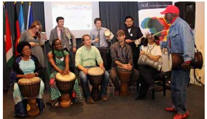
Workshop with MA Students at UMOJA Conference