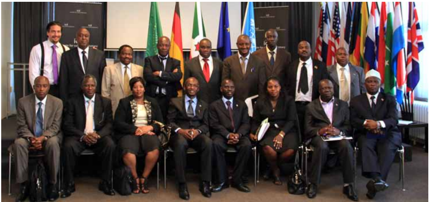
Delegation of Burundi Diplomats at the ICD House of Arts and Culture Seminar for Burundi Diplomats, September 2012

Berlin, September 2012 - The Ministry of External Relations and International Cooperation of the Republic of Burundi, in cooperation with the Institute for Cultural Diplomacy (ICD) and the Embassy of the Republic of Burundi to Germany, held a seminar for Burundi diplomats from 3-6th of September 2012.