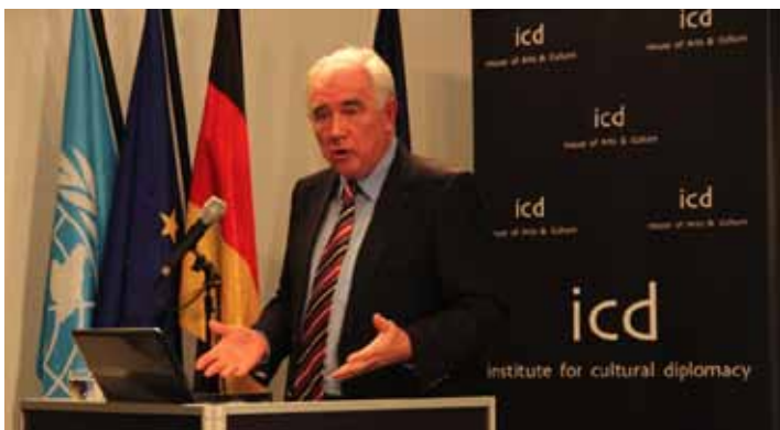
The Hon. Halldór Ásgrímsson, Secretary General for the Nordic Council of Ministers; Former Prime Minister of Iceland