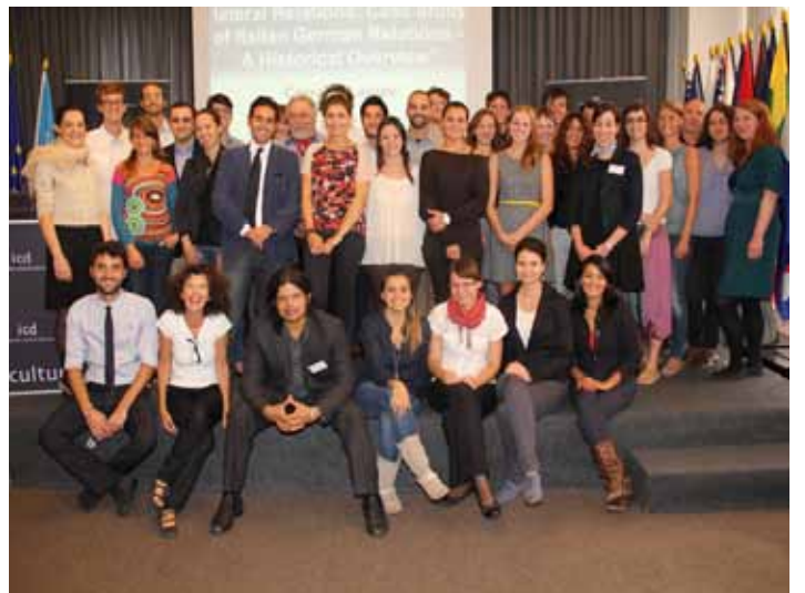
Italy Meets Germany - September 2012