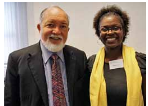
Sir James R. Mancham (Former President of the Seychelles) & participant at UMOJA Conference