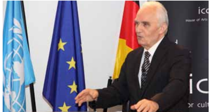
H.E. Yasar Yakis - Former Former Foreign Minister of Turkey and President of the ICD Young Leaders Forum

The broader goal, however, is to analyze ways in which governments can develop more effective and sustainable strategies to strengthen intercultural relations and promote greater social cohesion and harmony.