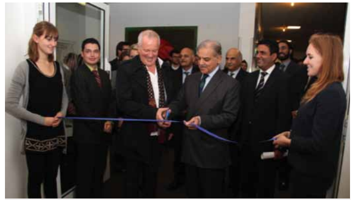
The Hon. Shahbaz Sharif and Leo Königsberg Official Ribbon Cutting and Opening of the Art Exhibition