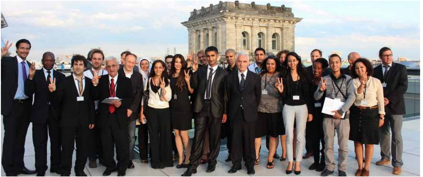
The YaLa Young Leaders Peace Summit German Bundestag, August 2012

We know that social media can drive change in our modern world, and the YaLa-Young Leaders movement is one such example of this.