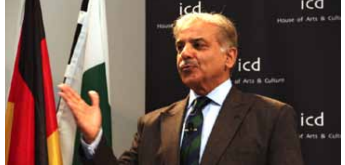
The Hon. Shahbaz Sharif - Lecture at the ICD House

The ICD was honored to host Pakistan's Hon. Shahbaz Sharif, Chief Minister of Punjab on 4th October at the ICD House, in an event that opened up a dialogue around issues facing the Middle East. In his Keynote Speech and the following interview, The Hon. Shahbaz Sharif explored themes around soft or 'smart' power, American-Pakistani relations and Western perceptions of the Muslim world.