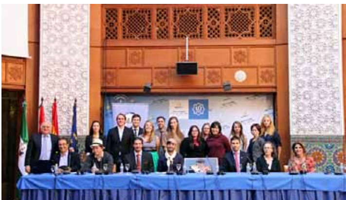
Students of the MA Program: "The Cultures of Spain Conference" Fundación Tres Culturas - Sevilla, October 2012