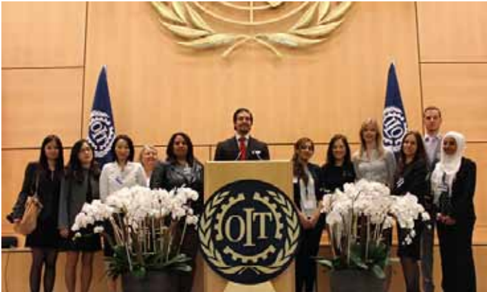
The 2012 International Symposia on Cultural Diplomacy United Nations Office at Geneva - June, 2012