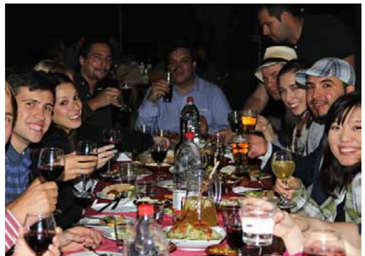
Students of the MA Program of the ICD Academy Center for Cultural Diplomacy during "The Cultures of Spain Conference"