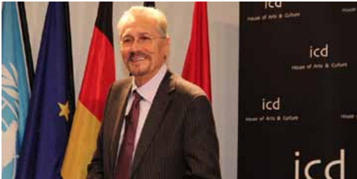
President of the ICD Academy Dr. Emil Constantinescu Former President of Romania

The ICD Academy for Cultural Diplomacy is the academic department within the ICD that works to analyze and raise awareness of the practice of cultural diplomacy by governments and non-state actors, and to explore new strategies for the strengthening of intercultural relations in general. The ICD Academy organizes the following three activities: The Center for Cultural Diplomacy Studies, Cultural Diplomacy Research and International Conferences.