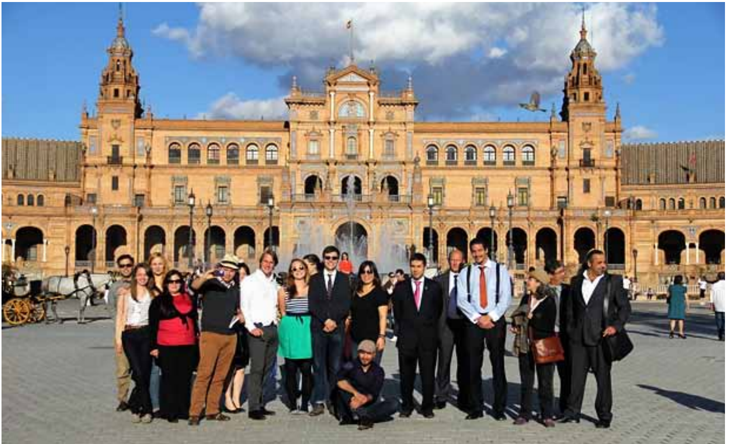
MA Students at The Cultures of Spain Conference Plaza de España, Sevilla - October 20th 2012

The Institute for Cultural Diplomacy, in collaboration with the Iman Foundation, organized “The Cultures of Spain Conference” in October 2012, focused on the influence of the Islamic, Renaissance and Baroque legacies on the history and culture of Spain. The conference was held in Cordoba, Sevilla and Granada from 18th – 20th of October 2012.