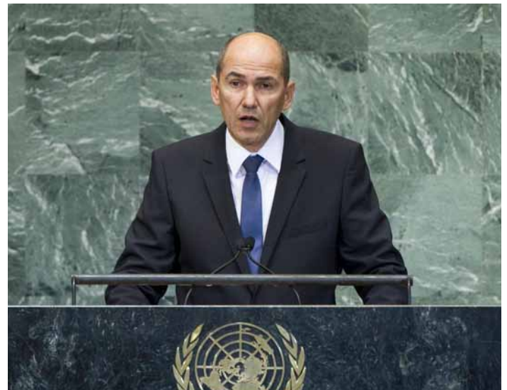
Prime Minister Janez Jansa 67th Session of the General Assembly of the United Nations

On 27th September, the Prime Minister of the Republic of Slovenia, Janez Jansa, Chairman of the Initiative, called at the 67th Session of the General Assembly of the United Nations to create an Independent Committee within the UN to revisit and review the Genocide Convention.