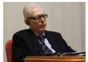
Dr. Lovro Šturm , Former Minister of Justice of Slovenia; Former Judge, the Constitutional Court of Slovenia