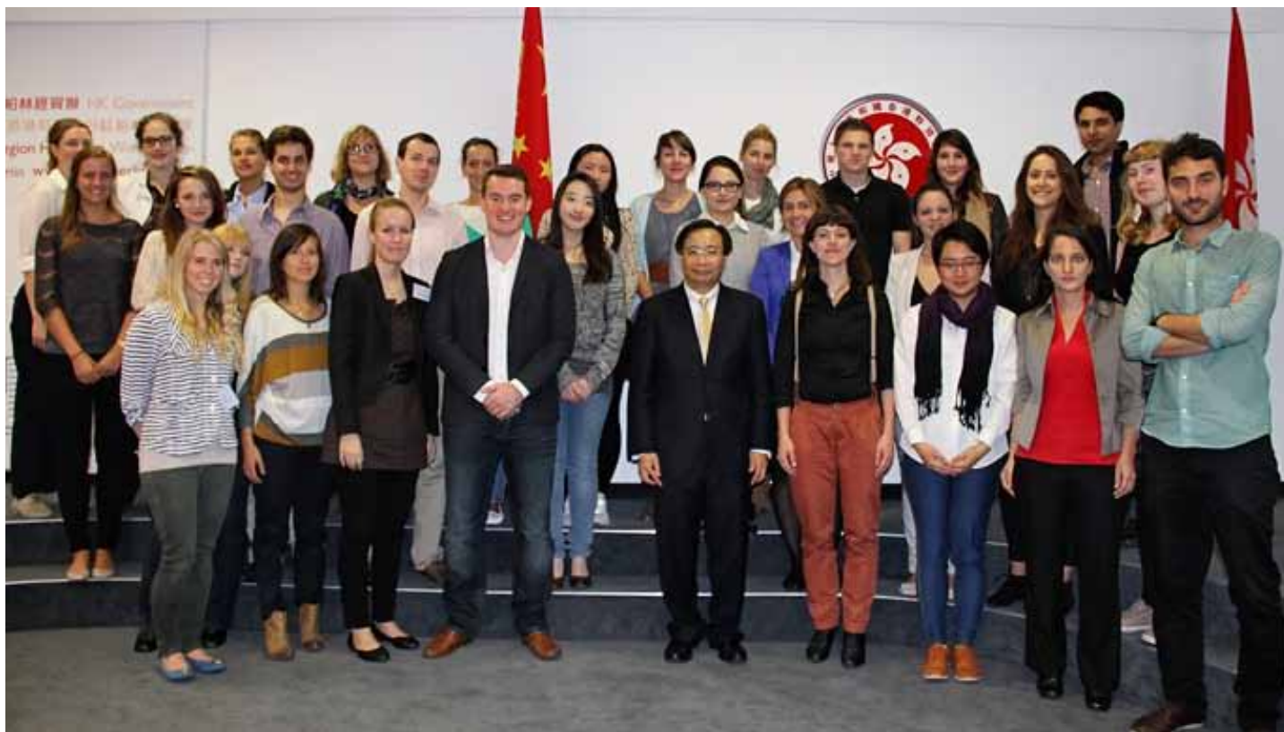
Group Photo at the Hong Kong Economic and Trade Office in Berlin Europe meets China, a Forum for Young Leaders

Weeklong Young Leaders Forums are held regularly at the ICD and consist of lectures, seminars, and workshops, together with cultural and social activities. The seminars aim to give young people an insight into the key dimensions of international relations and to introduce them to a network of like-minded individuals, as well as allowing them to explore the cultural landscape of the city of Berlin.