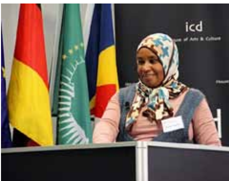
Participant Presentation UMOJA Conference