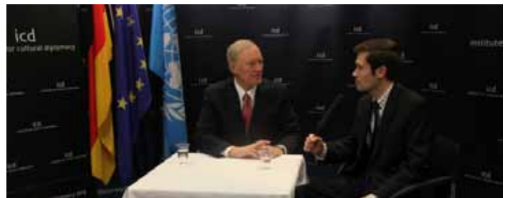
Interview with Governor Steve Merrill, 77th Governor of New Hampshire; President, Bingham Consulting