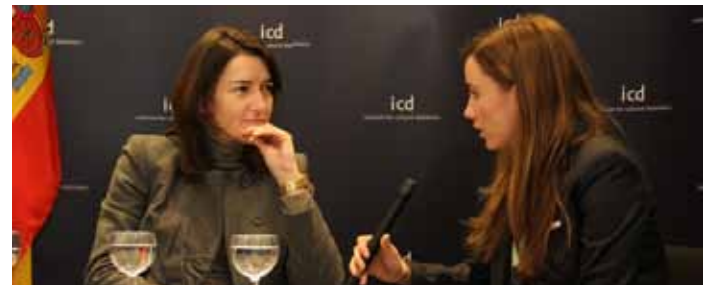
An Interview with the Hon. Ángeles González-Sinde Former Minister of Culture of Spain