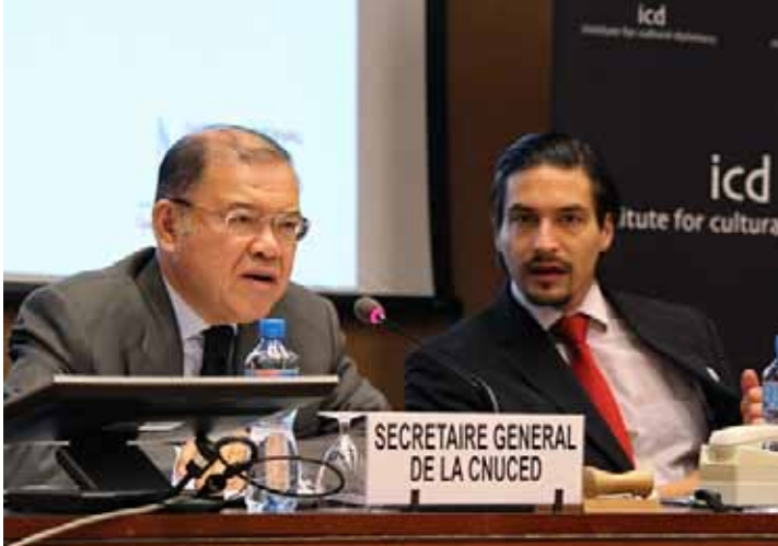
Dr. Supachai Panitchpakdi, Secretary-General of the UN Conference on Trade and Development (UNCTAD)