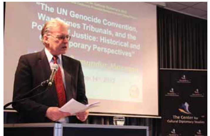
Minister Ögmundur Jónasson, Min. of the Interior of Iceland; Former Min. of Justice & Human Rights - "The UN Genocide Convention, War Crimes Tribunals & the Politics of Justice: Historical and Contemporary Perspectives"

Especially in 2012 given the urgent and dramatic mass atrocities taking place around the world, the ICD has given a major focus on the issue of cultural diplomacy, genocide prevention and the right to protect. In addition to the engagement of the ICD around the world in 2012, we dedicated one component of the Annual Conference on Cultural Diplomacy to this issue as well. We brought together an interdisciplinary and international group of experts and practitioners to discuss the current human rights challenges, but in particular the issue of prevention and what can be done to prevent these atrocities from taking place in the future.