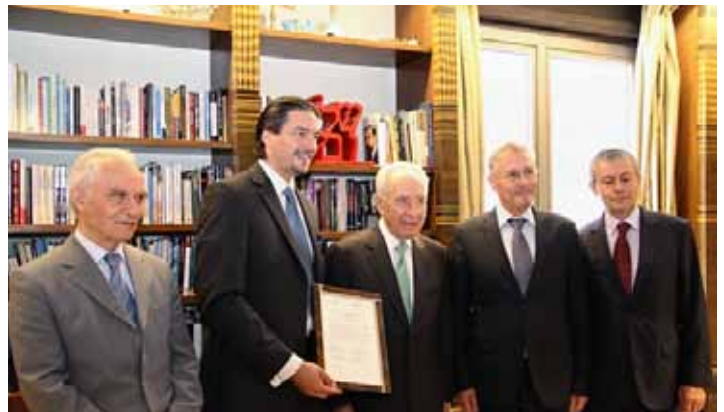
Meeting with the President of Israel - Peace Delegations between Israel and Palestine - Jerusalem, July 2012