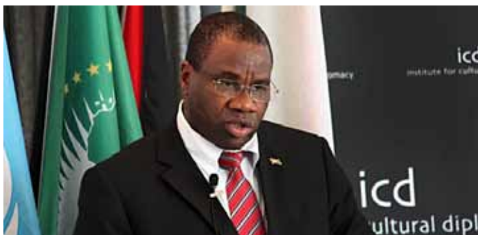
H.E. Minister Laurent Kavakure, Min. External Relations and International Cooperation of the Republic of Burundi