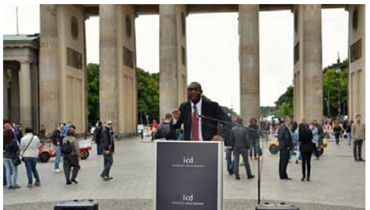
The 2012 International Symposia on Cultural Diplomacy Brandenburger Tor - Berlin, June 2012