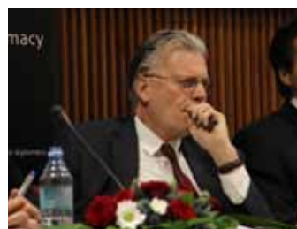
Minister Ögmundur Jónasson , Minis- ter of the Interior of Iceland; Former Minister of Justice & Human Rights