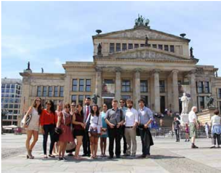
Europe Meets Latin America - Berlin, August 2012