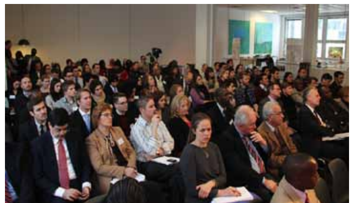
Participants and guests at the ICD Annual Conference 2012