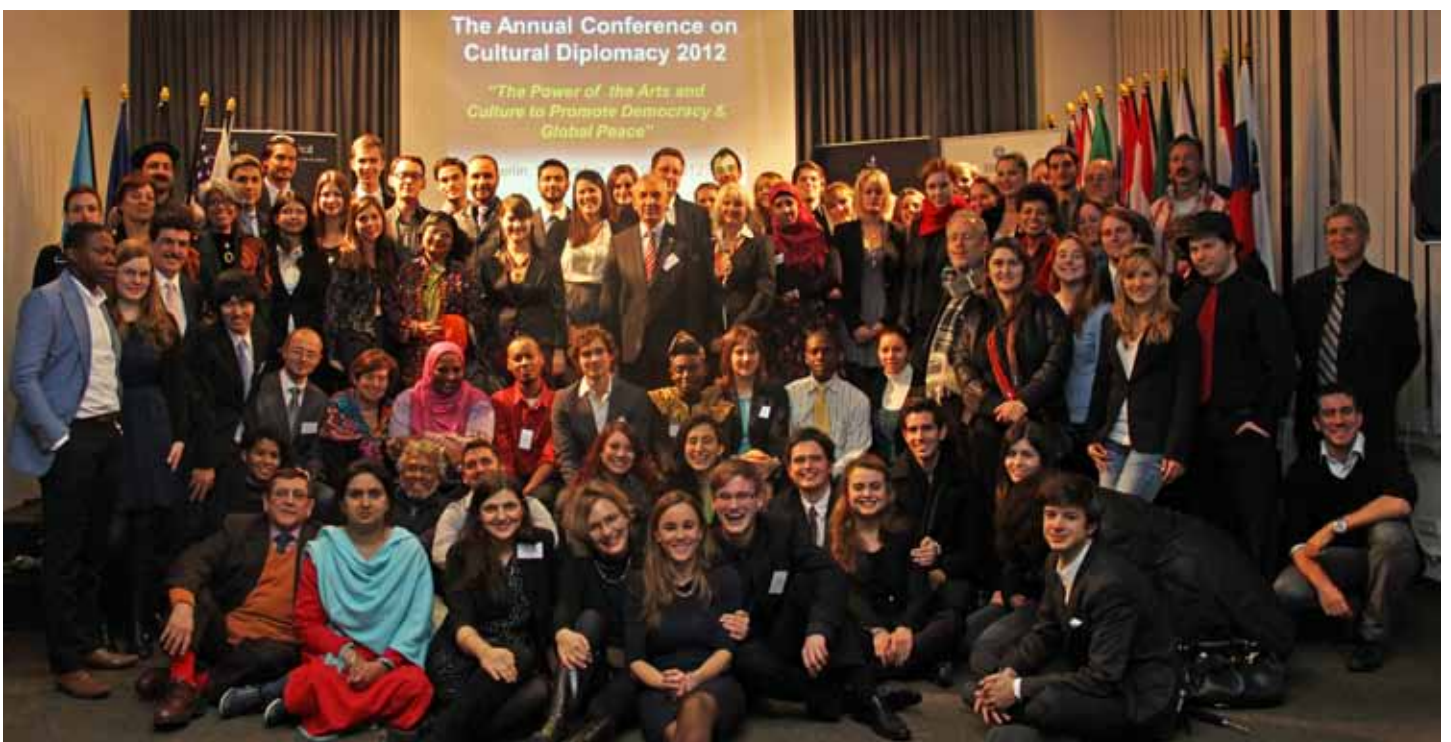
Family Photo at the ICD Annual Conference on Cultural Diplomacy 2012