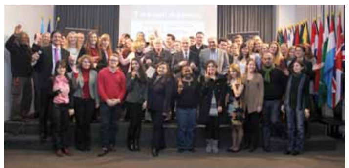
Group Photo with the participants Cultural Bridges in Germany Conference, November 2012