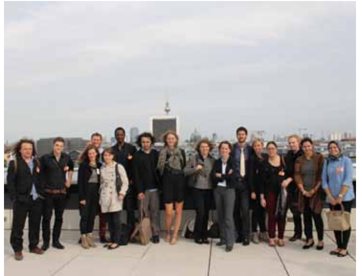
Cultural Diplomacy in Europe - September 2012