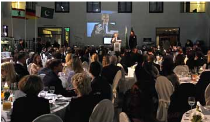
The Hon. Shahbaz Sharif Reception at the Hotel Moa Berlin