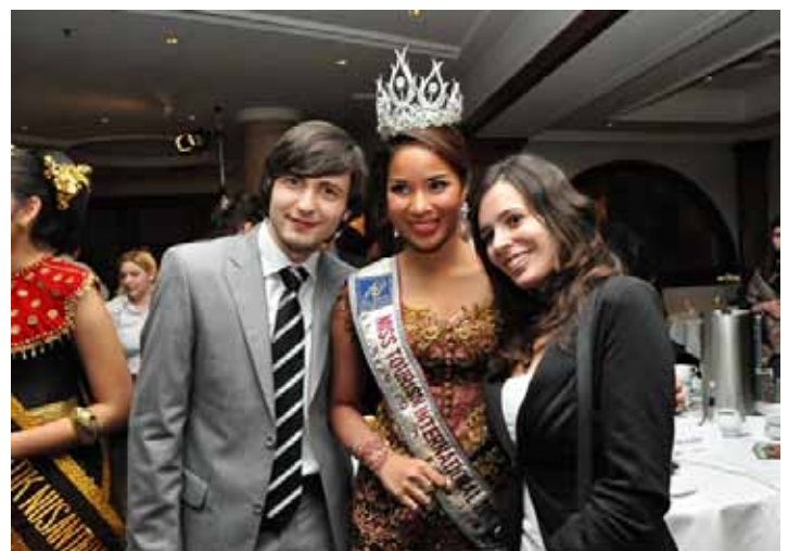
The Berlin International Economics Congress 2012