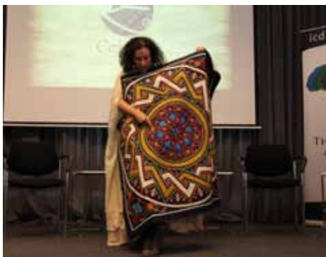
Participant Presentation UMOJA Conference