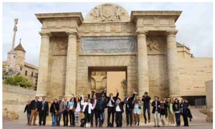
Students of the MA Program of the ICD Academy Center for Cultural Diplomacy during "The Cultures of Spain Conference"