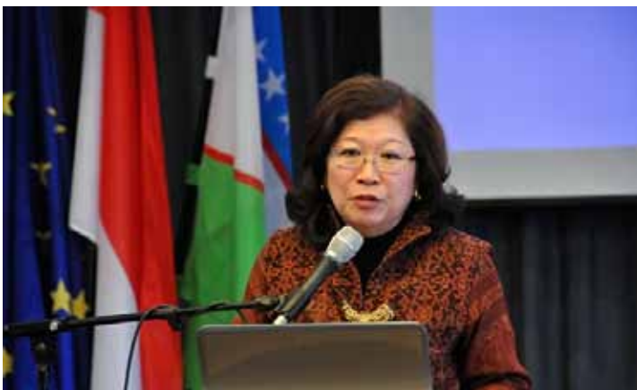
The Hon. Minister Mari Elka Pangestu Minister of Tourism & Creative Economy of Indonesia