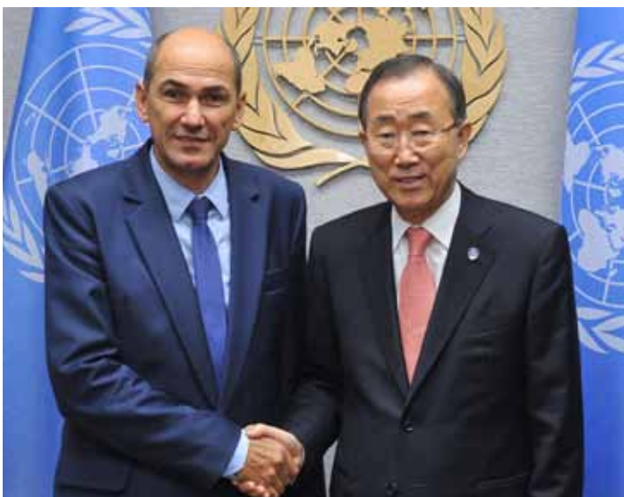
Prime Minister Janez Jansa with the UN Secretary General Ban Ki Moon

The European People's Party (EPP) passed on Thursday October 18th 2012, at its Congress in Bucharest a Resolution on the Responsibility and Protection of Genocide Prevention, which is based on the UN Genocide Convention Initiative of the ICD.