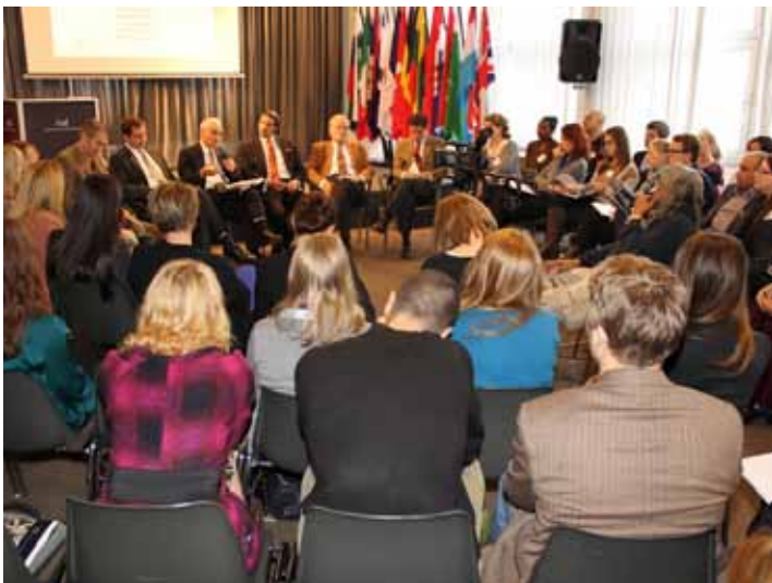
The Cultural Bridges in Germany (CBG) - Nov. 2012