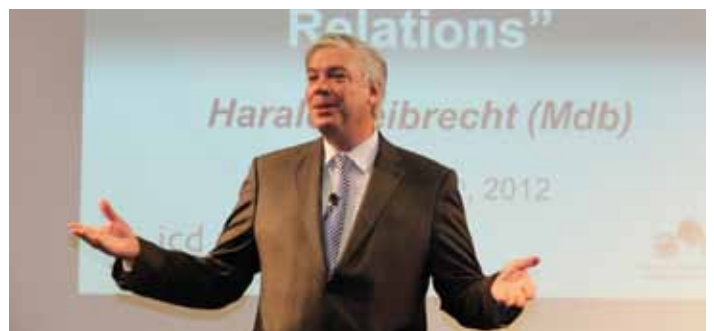
Harald Leibrecht (Mdb) Member of the German Parliament; The Free Democratic Party