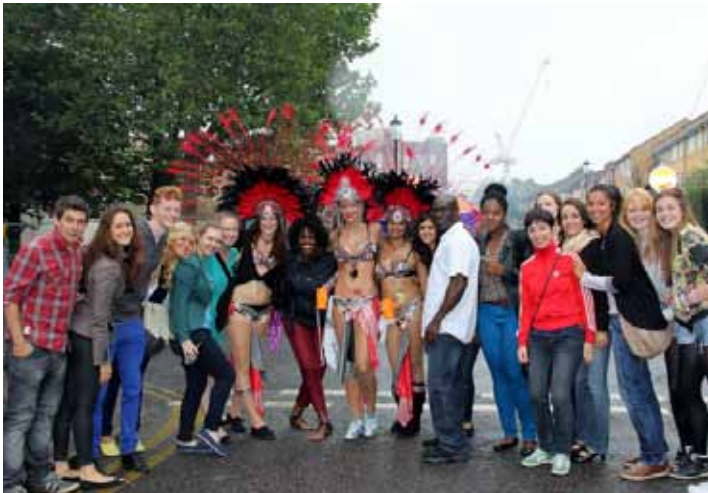
Art as Cultural Diplomacy - London, August 2012