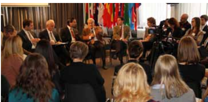
Panel Discussion Integration of Immigrants in Germany & the EU: Best Practices