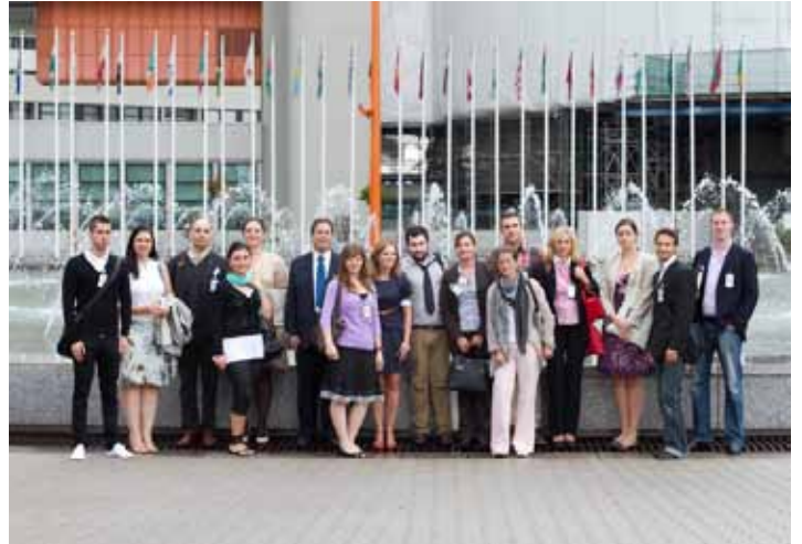
Cultural Diplomacy in Europe - Vienna, July 2012