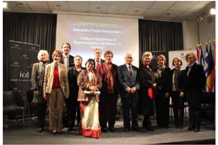
Interactive Panel Discussion at the ICD Annual Conference 2012 "Cultural Diplomacy & Representation of Women in Politics"