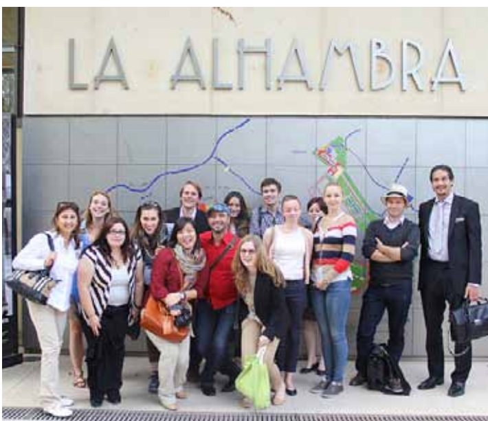
MA Students at The Cultures of Spain Conference La Alhambra, Granada - October 19th 2012