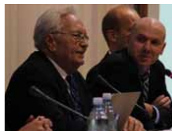
Dr. Zvonimir Paul Separovic , Former Minister of Justice, Republic of Croatia