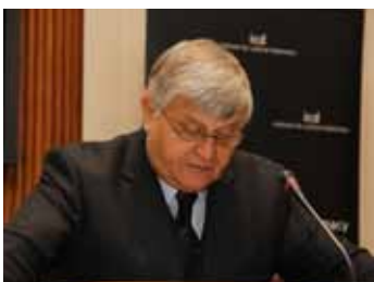
Judge. Wolfgang Schomburg , Permanent Judge at the (UN) International Tribunal for the former Yugoslavia