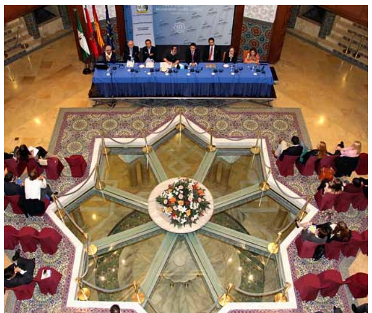
MA Students at The Cultures of Spain Conference Fundación Tres Culturas, Sevilla - October 20th, 2012