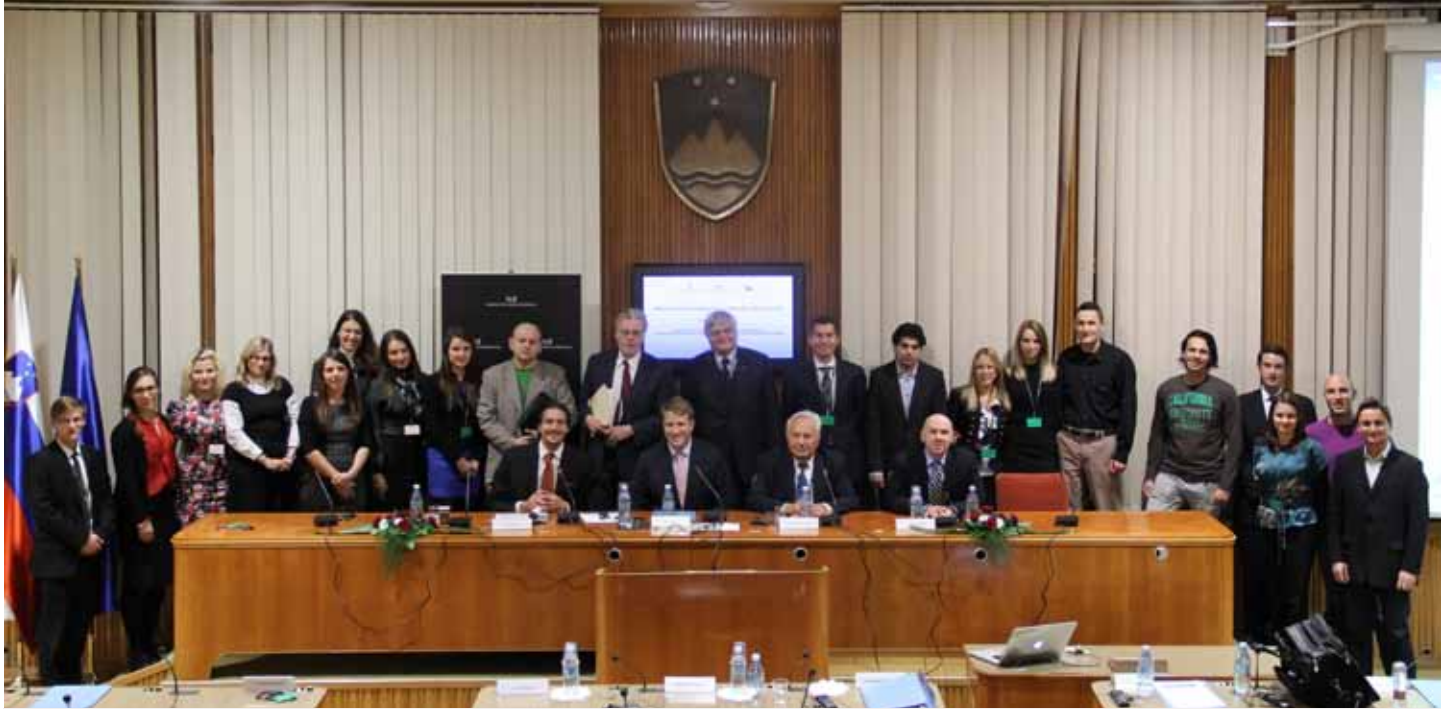
Group Photo at The Ljubljana Human Rights Summit 2012 Ljubljana, International Conference, October 30th 2012

The Syria Crisis and the Responsibility to Protect: An Interdisciplinary Analysis of the Challenges in Securing an International Consensus