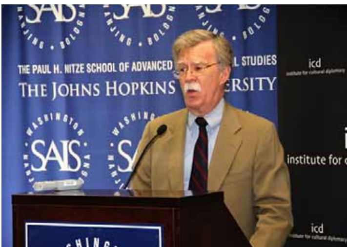
Amb. John R. Bolton, 25th United States Ambassador to the United Nations