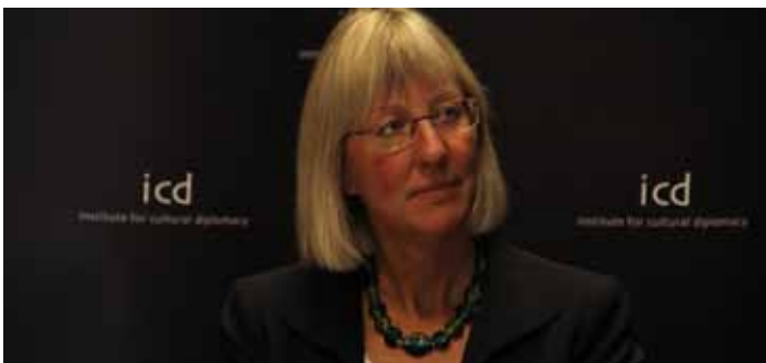
Ingrid Hönlinger (Mdb) Member of the German Parliament