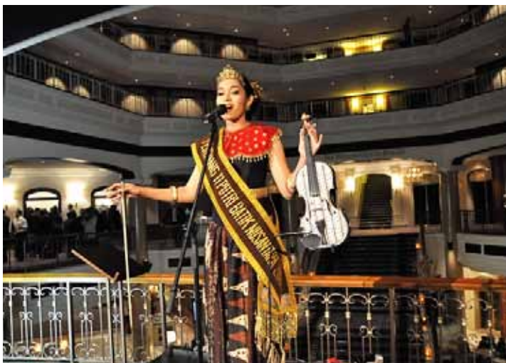
The Berlin International Economics Congress 2012