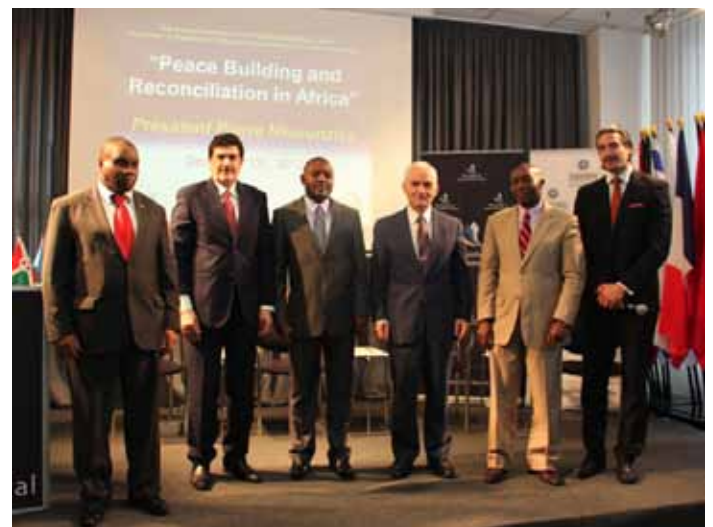
H.E. Minister Laurent Kavakure, Min. of External Affairs and International Cooperation of the Republic of Burundi; The Hon. Dr. Nazar Al Baharna, Former Foreign Minister of Bahrain; H.E. President Pierre Nkurunziza; H.E. Yasar Yakis, Former Foreign Minister of Turkey; H.E. Amb. Eduard Bizimana and Mark Donfried.